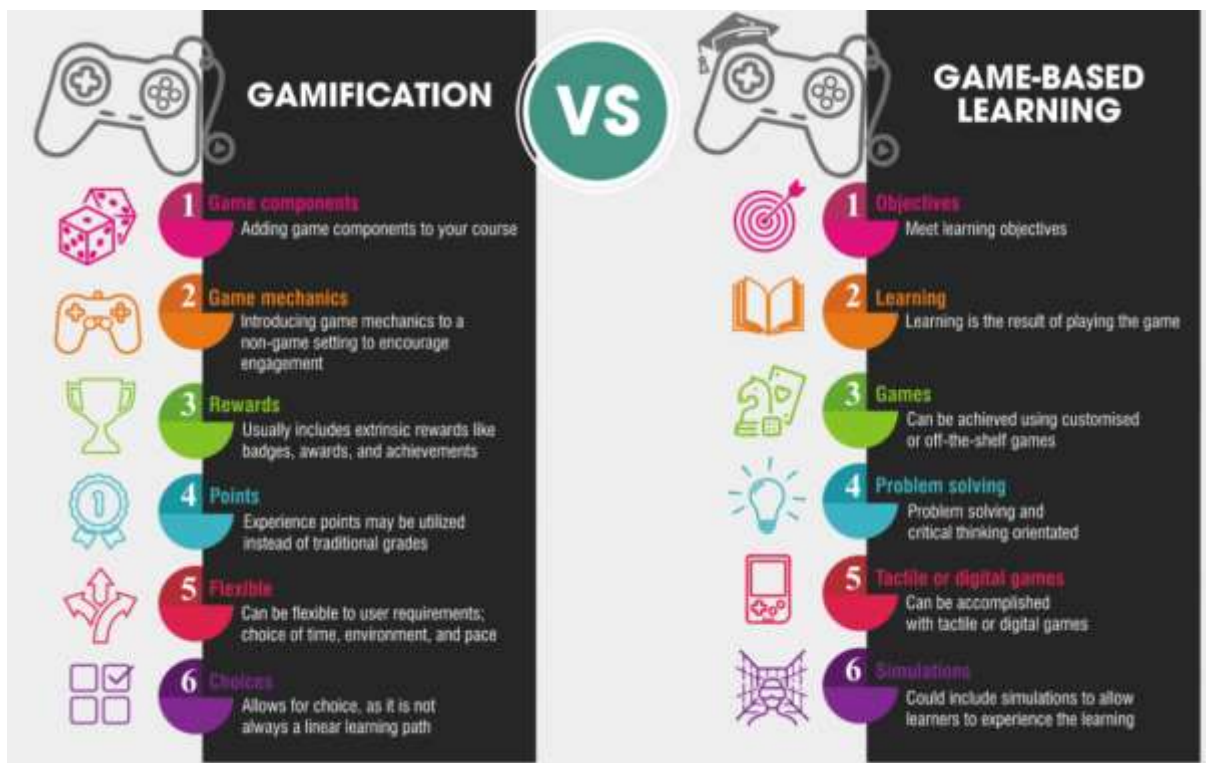
Figure 1.: The differences between Gamification and Game-Based Learning