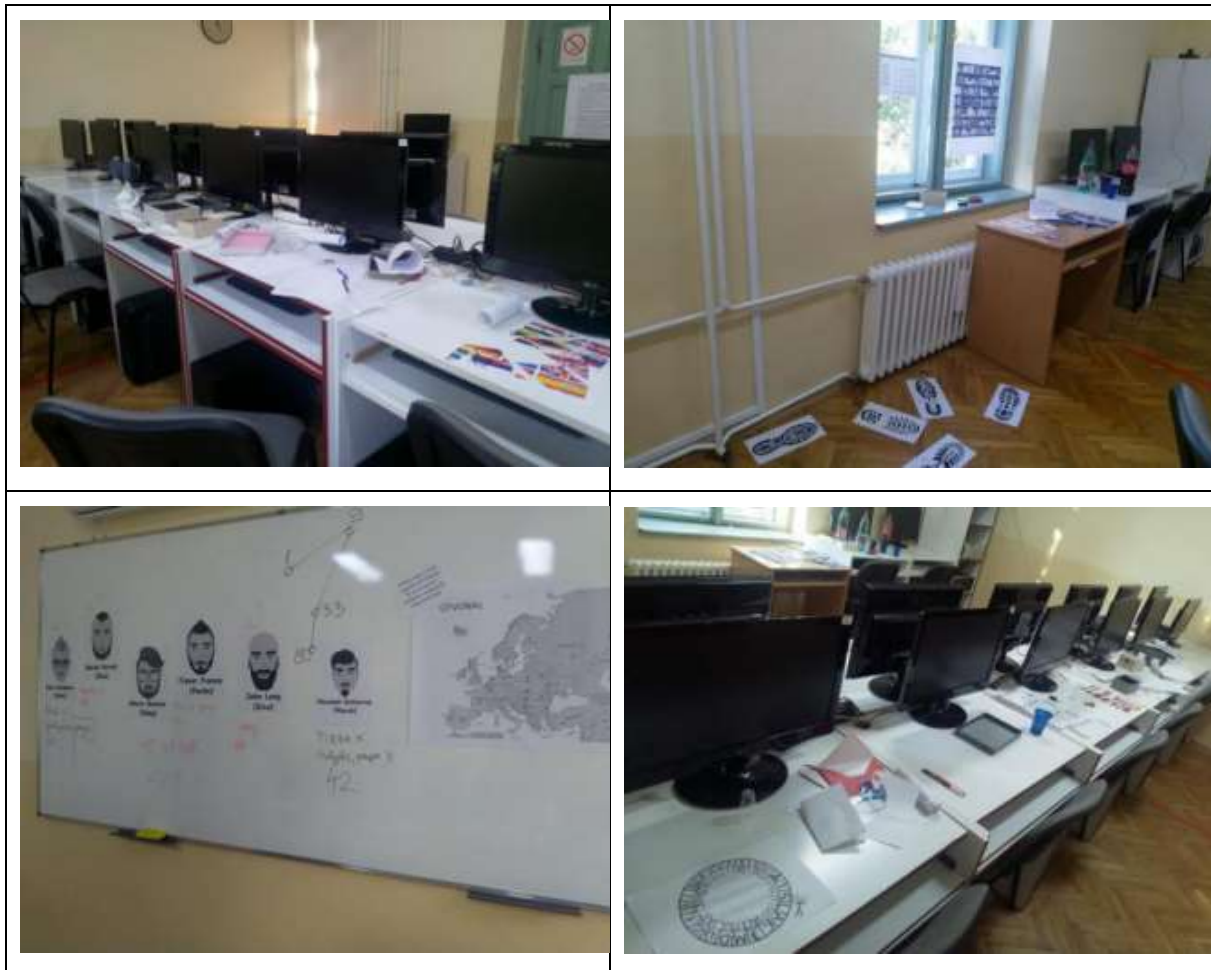
Figure 5.: The look of the room after playing the game

Students in the second group also noticed that everyone showed outstanding knowledge in other tasks and that communication was an essential part of the smooth play.