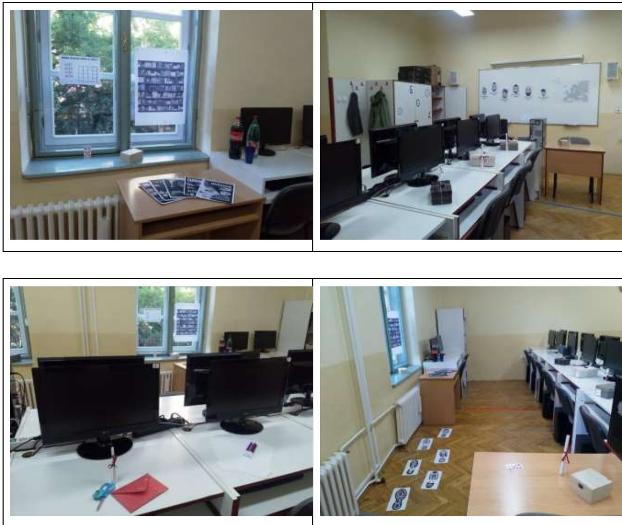
Figure 2.: The appearance of the escaping room before starting the game test